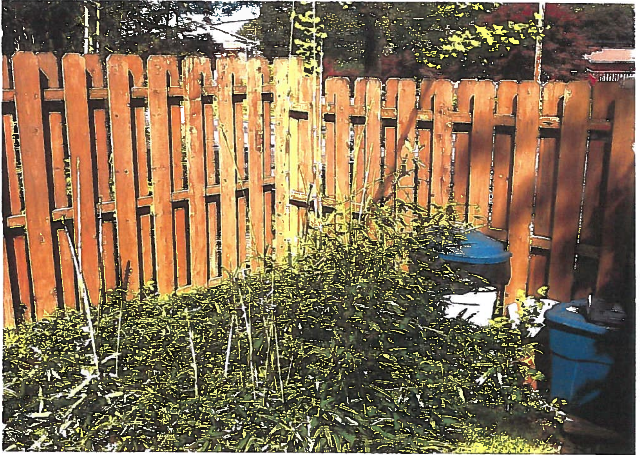
1935 Bayard St.